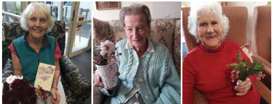
These photos are available on request.